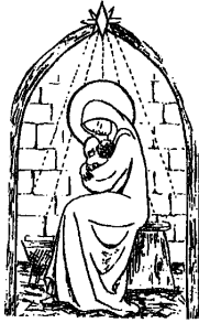
Peace of Christ!

Carmelite Monastery 52 Halswell Road Christchurch 8025 New Zealand